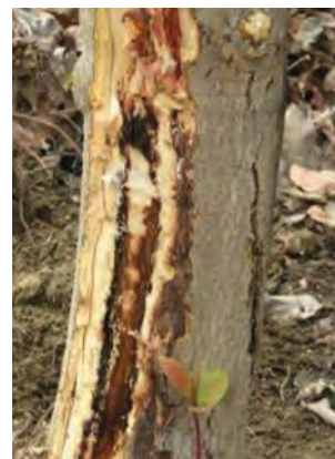
(Left) Basal bark cracking. (Right) Canker caused by P. menzei extending into lower branches and trunk