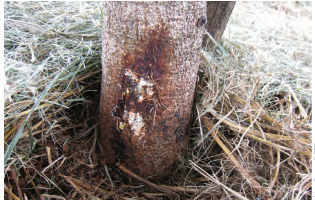
Ken Pegg, DEEDI

P. menzei is a soilborne pathogen. It is spread in surface water, infested soil and infected nursery plants.