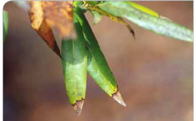
Infected leaves often show black 'zone lines' surrounding the edges of dead areas.

Fungal Armillaria species can cause bleeding cankers like sudden oak death but can be easily distinguished by the white fans of thread-like fungus under the bark of infected trees.