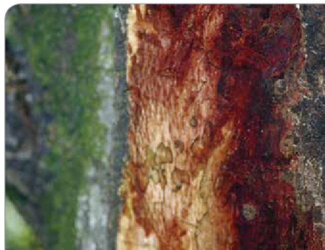
Dark stains can be seen underneath the bark of infected trees.

To monitor for sudden oak death, check your crop regularly for symptoms such as black spots on leaves, dieback and dark bleeding cankers above the soil line. Pay attention during and after wet periods as this is when the disease is most infectious. It is important to report suspected symptoms early because it can be difficult to distinguish sudden oak death from other diseases.