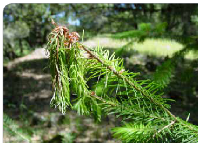
Sudden oak death affects above ground plant parts causing wilting and dieback.

Joseph O'Brien, USDA Forest Service, United States