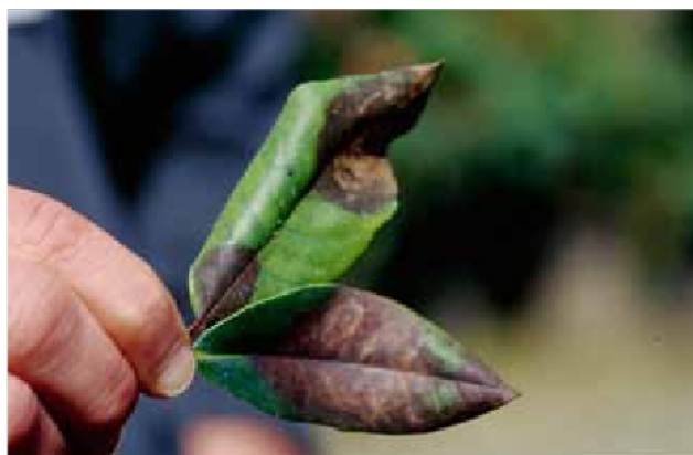
Leaf lesions in rhododendrons, demonstrating the typical diffuse margins

The development of bleeding stem cankers, blackened shoots or diffuse lesions on leaf tips.