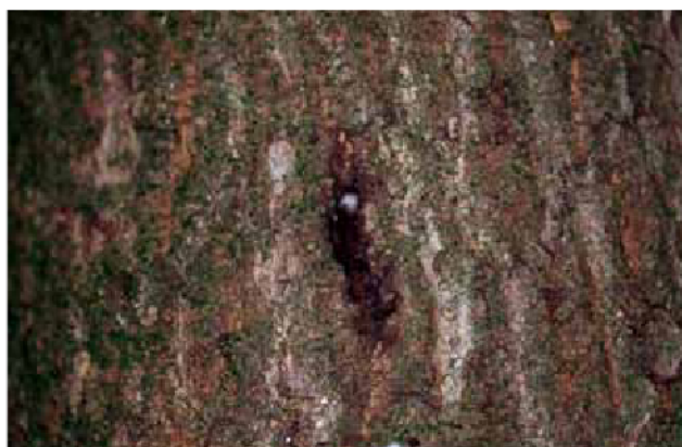
Bleeding trunk canker resulting from P. ramorum infection