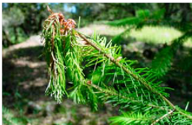
Shoot dieback symptoms developing on Douglas-fir