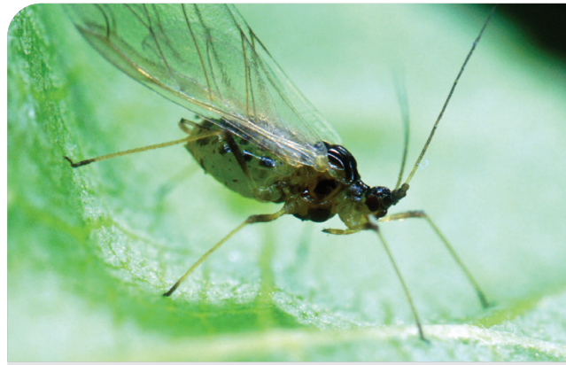
Virus symptoms on plum leaves

Source planting material and orchard inputs only from 'clean', accredited suppliers. Check your orchard frequently for the presence of new pests and unusual symptoms. Make sure you are familiar with common cherry pests so you can tell if you see something different.