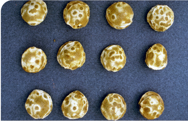
Internal and external fruit symptoms in apricots, including brownish depressions and grooves on the fruit surface