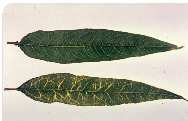
Chlorotic spot symptoms on peach fruit