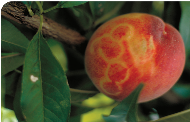
Chlorotic spot symptoms on peach fruit