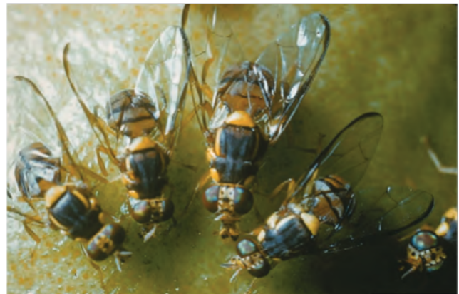
The thorax (chest) has yellow stripes on top and yellow marks on each side