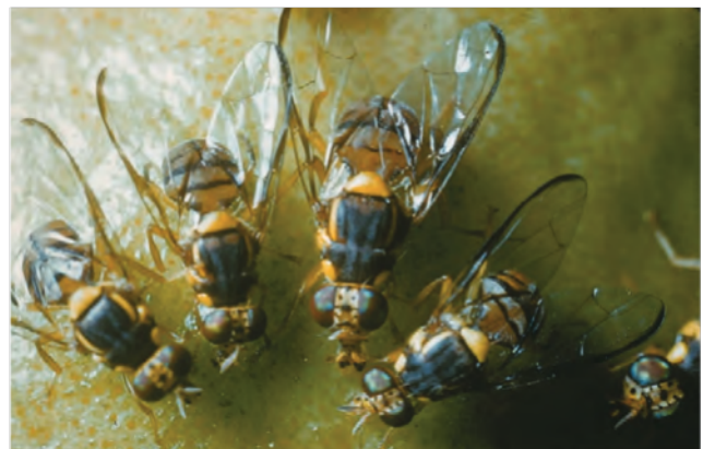
The thorax (chest) has yellow stripes on top and yellow marks on each side