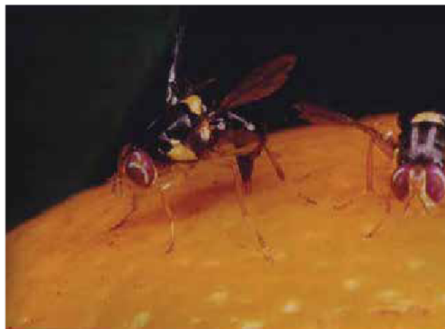
Adult Fijian fruit flies