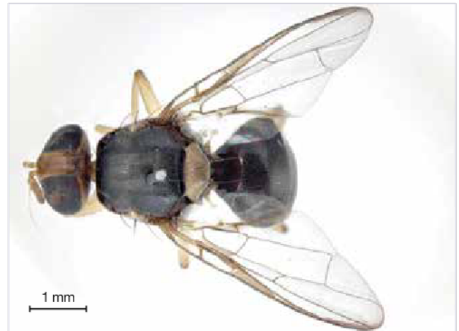
Dorsal view of adult Fijian fruit fly

Adult Fijian fruit fly can disperse over long distances through flight, while the transport of larvae in infested fruit can result in the global movement of the pest.