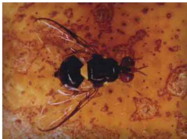
Adult Fijian fruit flies