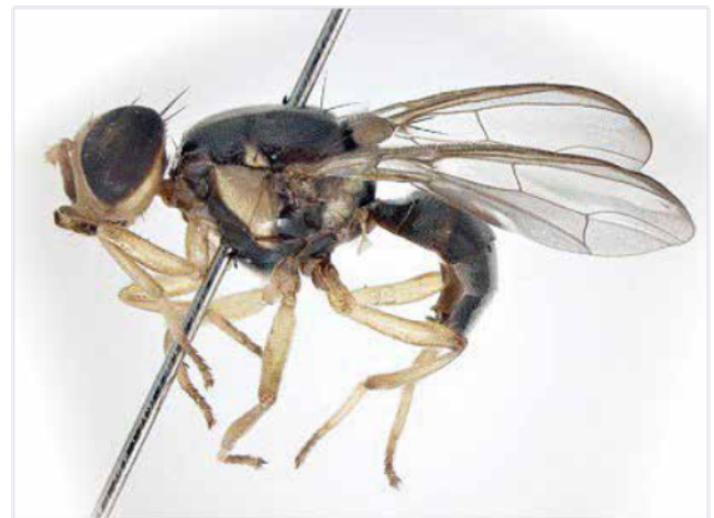
Lateral view of Fijian fruit fly. Note: fly is predominantly black in colour