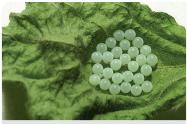
Eggs on underside of leaf