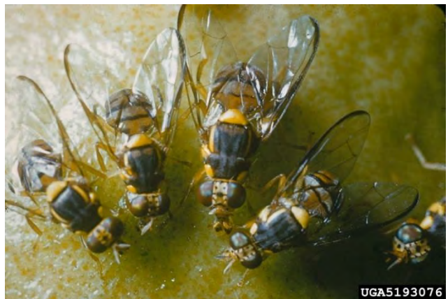
Adult oriental fruit flies on fruit surface