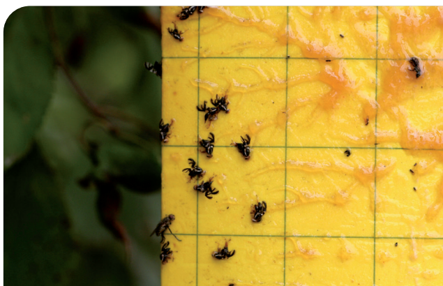
Monitoring for apple maggot can be completed using a yellow sticky trap