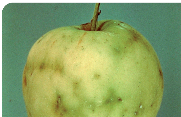
Dimpling of the fruit surface resulting from infestation