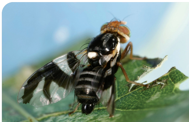
The apple maggot can be distinguished by the zigzag pattern on the wings and the pronounced white spot on its back

On the surface of the fruit, oviposition punctures and sunken dimples can be seen, together with occasional discolouration around the puncture marks. When fruit is cut open, characteristic brown trails left by larvae can be seen. The honeycombed flesh may eventually break down and apples may drop prematurely.