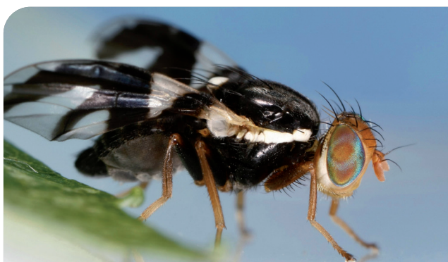
Adult flies are similar to other small fly species, with the exception of the zigzag pattern on the wings and white dot on back

Whitney Cranshaw, Colorado State University, Bugwood.org