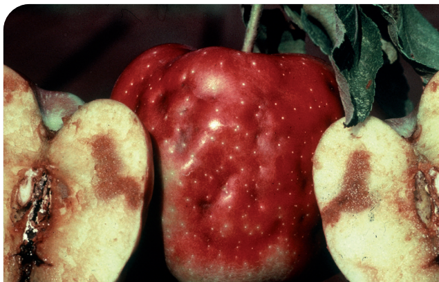
Fruit surface dimpling and internal larval feeding tracks in infested apples