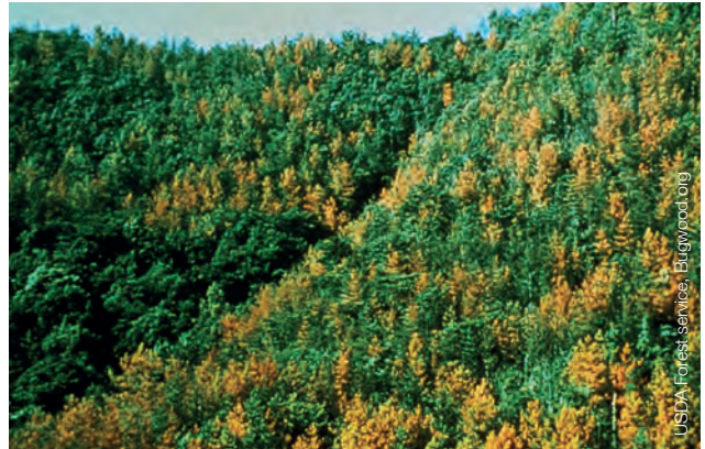
Pinewood nematode damage

Pine sawyer beetles ( Monochamus spp.) attack a range of conifers including Pine ( Pinus ), Spruce ( Picea ), Larch ( Larix ) and Fir ( Abies ). Pines are the preferred hosts.