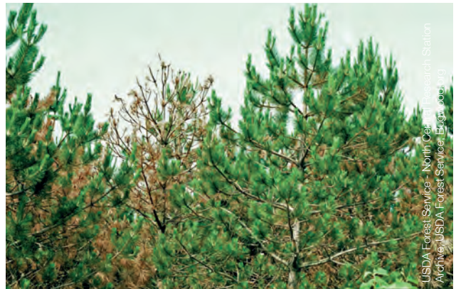
Pinewood nematode infected Black pine ( P. nigra )