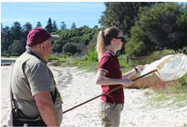
Floral sweep netting is used to detect any foraging exotic pest bees.

Floral sweep netting has been proposed as the most efficient and effective surveillance method to provide early detection of high priority pest bees including the red dwarf honey bee ( A. florea ), the giant honey bee ( A. dorsata ), exotic and established strains of Asian honey bee ( A. cerana ), and European honey bee ( A. mellifera ) or bumble bees ( Bombus terrestris ).