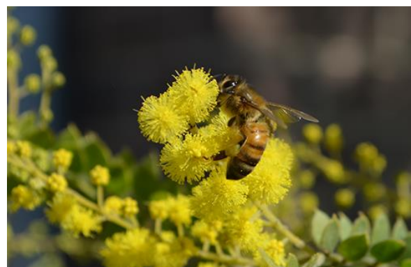
Australia has a healthy honey bee population and the National Bee Pest Surveillance Program is trying to keep it that way.