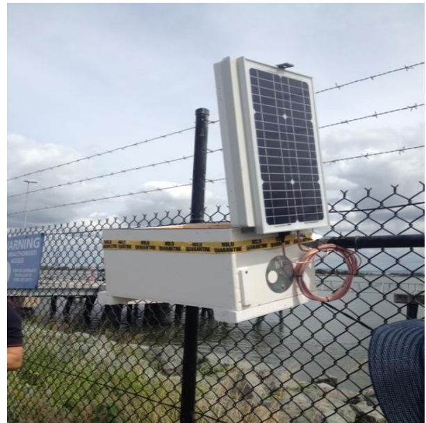
Remote surveillance catchboxes have a camera and sensors to automatically send an alert if a bee swarm enters

The phone captures an image at frequent intervals and performs image analysis to determine the presence of a swarm. The phone uploads an image on a daily basis or if activity is detected by image analysis. Power to the phone is provided by a solar panel and batteries in the catchbox lid. An electronic door on the catchbox entry can be triggered remotely to close and open the hive door.