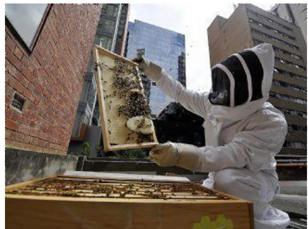
Sentinel hives are set up at locations across Australia and are regularly inspected for exotic pests like mites

Hives of European honey bees ( Apis mellifera ) of a known health status that are maintained at locations believed to be of high risk throughout Australia. These hives are visually inspected every six weeks for large African hive beetle, braula fly and small hive beetle. Acaricides (miticides) are used to check for external mites. Samples of adult bees are taken to labs for diagnosis of internal mites and viruses.