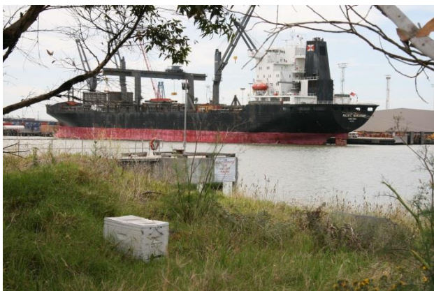
Catchboxes are set up at ports to capture swarms that may arrive on vessels and cargo

Newly arriving swarms of European honey bee (i.e. inadvertently imported on cargo/vessels) as well as the local A. mellifera population may also be picked up using catchboxes and can subsequently be sampled for exotic mites on a regular basis.