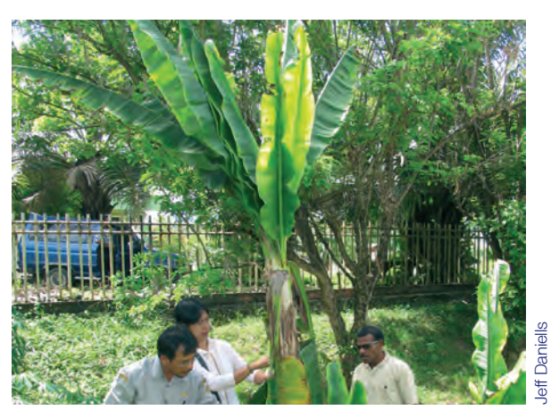
Typical bunching of emerging leaves