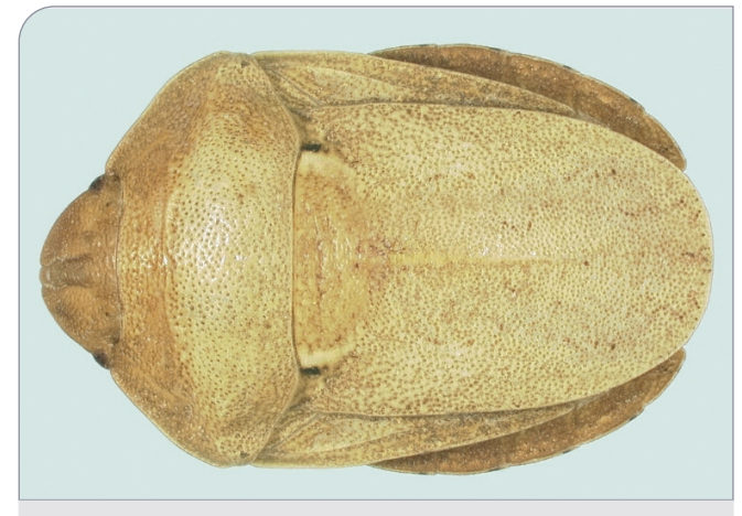
Adult sunn pest