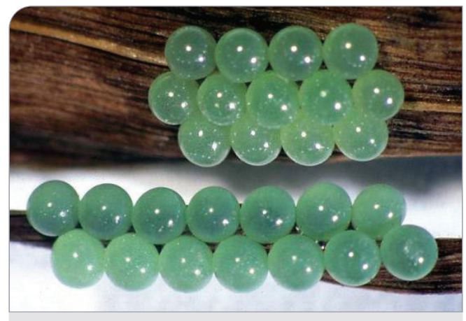
Sunn pest eggs, approximately 1 mm in diameter, are laid in clumps on host plant leaves