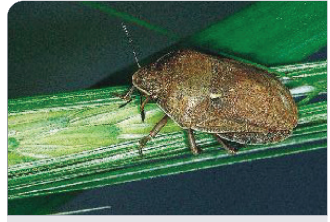
Adult on young grain head

If you see anything unusual, call the Exotic Plant Pest Hotline on 1800 084 881 .