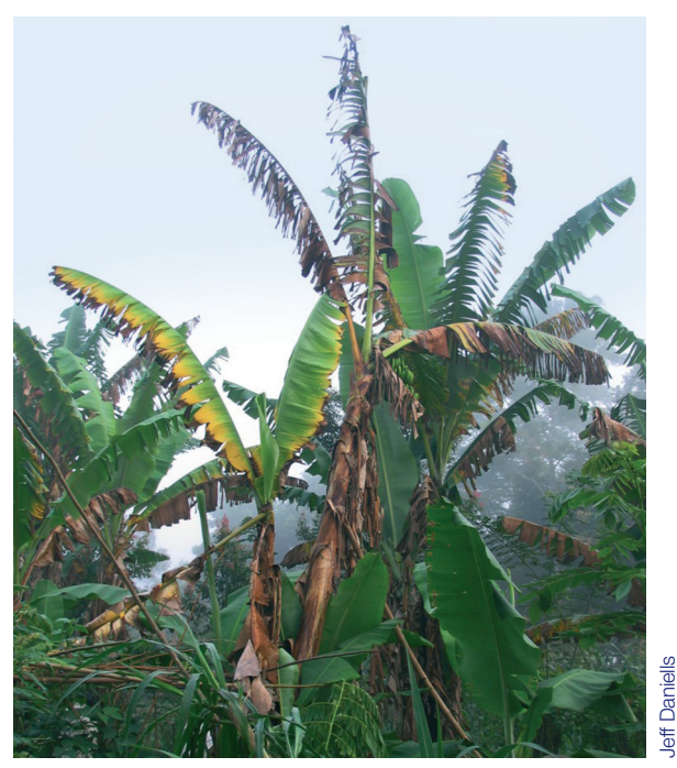
As the disease progresses, older leaves die and form a skirt around the lower part of the plant