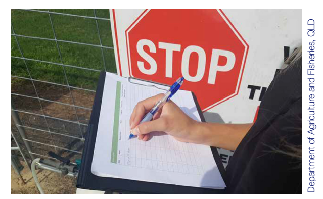
Record keeping should be a routine part of on-farm biosecurity practices

For more information about Panama disease tropical race 4 contact Biosecurity Queensland on 13 25 23 or visit bit.ly/PanamaTR4