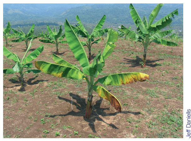
Initial external symptoms of Panama disease include yellowing leaf margins on older leaves