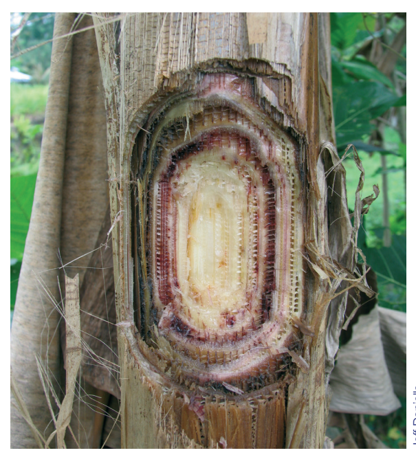
Internal browning of stems and corms is the key diagnostic symptom of Panama disease

Affected plants rarely produce marketable bunches.