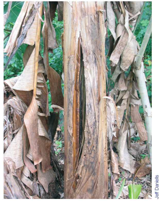
Splitting of the pseudostem associated with Panama disease infection