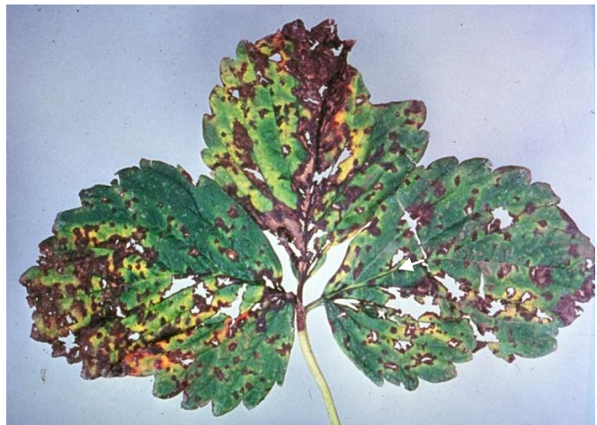
Strawberry leaf severely affected by X. fragariae . Note its ragged appearance and the coalescence of the spots along the main veins.

Look out for angular leaf spots, appearing at first as small 1-4mm angular water soaked spots on the lower surface of the leaf. The spots are translucent against light. They later enlarge and coalesce and after about 14 days start to become visible on the upper surfaces of the leaves becoming reddish brown in colour. The dead tissues tear and break off and the diseased leaves appear ragged in appearance. In severe cases, plants may become defoliated.