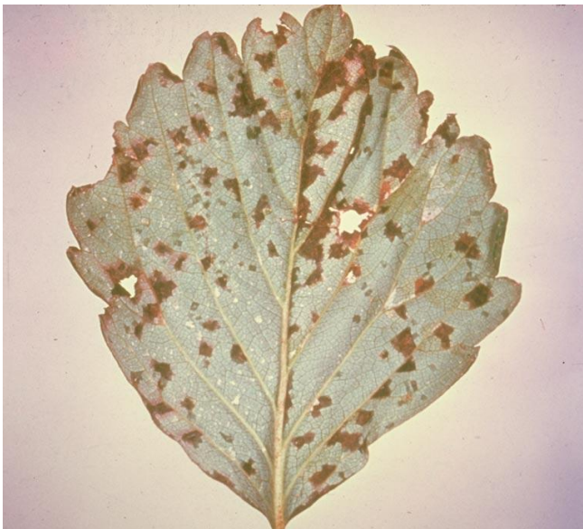
Lower surface of a strawberry leaflet affected by X. fragariae . Angular, water-soaked and reddish-brown spots are evident.