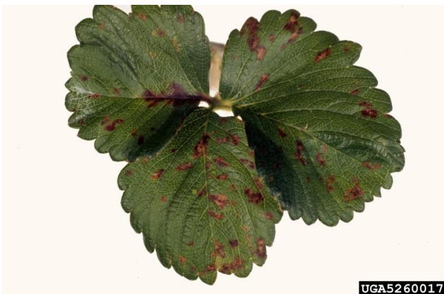
Leaf showing angular, water soaked spots caused by X. fragariae infection