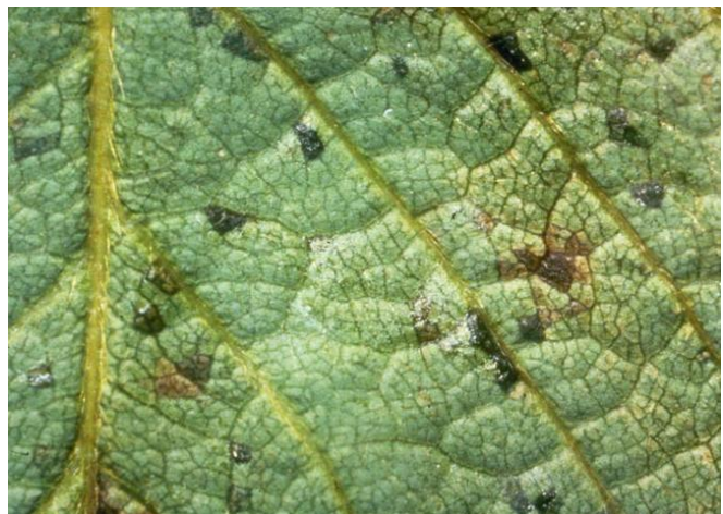
Close-up of X. fragariae lesions on strawberry leaf