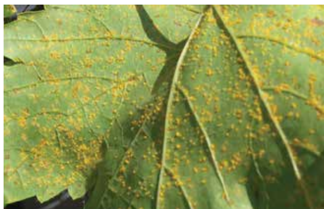
On the lower leaf surface, the lesions are covered by orange to yellow sporulating pustules