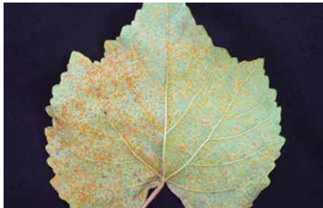
Symptoms from infection on the low surface of a grapevine leaf