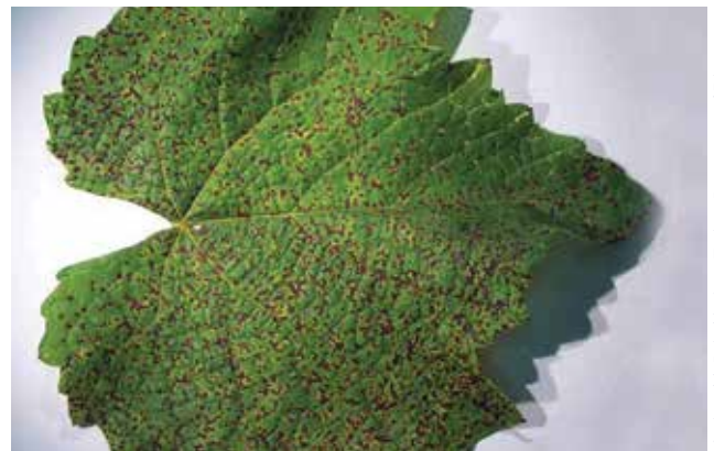
Andrew M. Daly, Northern Territory Department of Primary Industry and Fisheries

The difference in symptoms of Grapevine leaf rust can be observed on the upper and lower surface of leaves