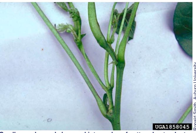
Swollen nodes and abnormal internodes of cotton due to plant bug feeding