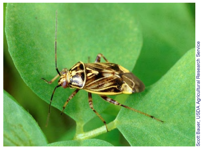
Tarnished plant bug (L. lineolaris) adult

If you find any bugs that look like these (see figures on left) you should report them to ensure they are not these exotic plant bugs.