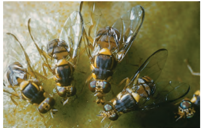
The thorax (chest) has yellow stripes on top and yellow marks on each side