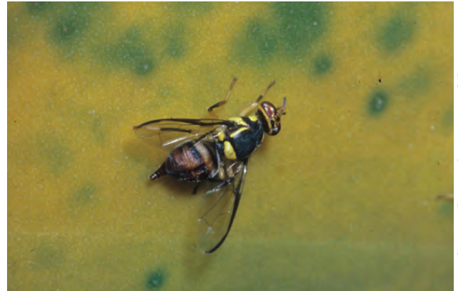
Adults grow up to 6-8mm in length

Source plant material only from 'clean', accredited suppliers, and preferably material that is certified. Check your orchard frequently for the presence of new pests and unusual symptoms. Make sure you are familiar with common avocado insect pests so you can tell if you see something different.