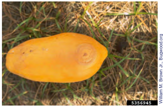
Damage to a papaya caused by the oriental fruit fly