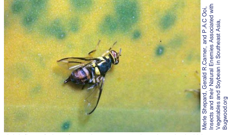
Adult fly on fruit surface, where eggs are then deposited within the fruit