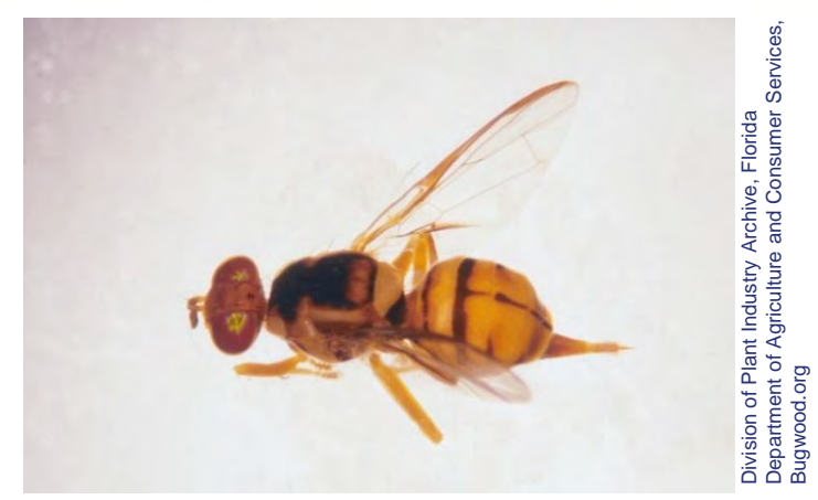
Female adult oriental fruit fly specimen