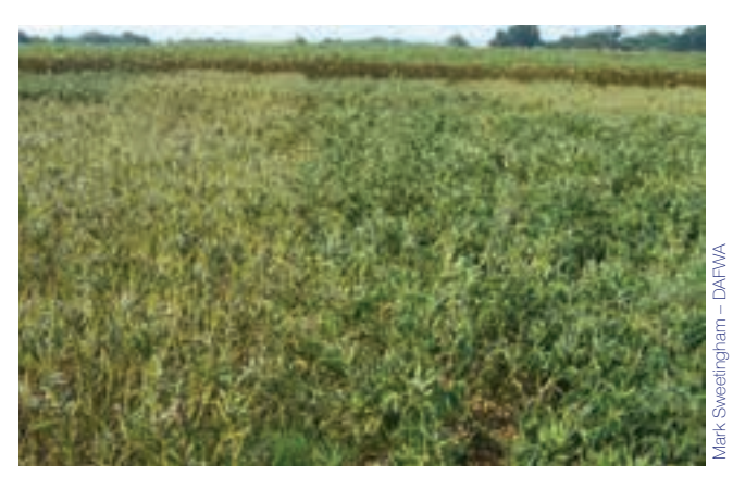
Lupin infected paddock (note defoliation and leaf colour)