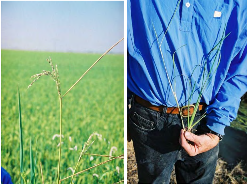
Figure 1. Infection by Gibberella fujikuroi produces elongated, slightly yellow plants, with pronounced projection of the flag leaf (left); infected plants compared with healthy plant (right)