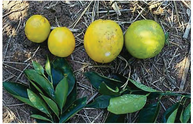
Leaf scorch symptoms on citrus