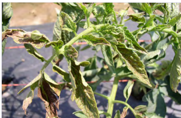
Close-up of the leaflets with areas of purple/brown tissue due to infection with TSWV