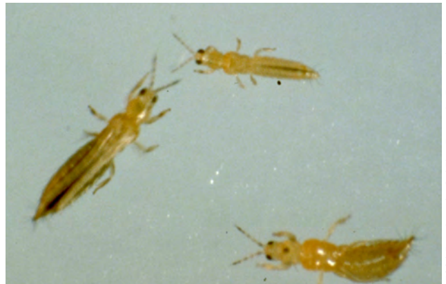
WFT are yellow or brown in colour with bodies 1-2 mm long

Infested crops can be damaged directly through feeding, which leads to leaf discolouration, deformed new growth and buds, and spotted foliage. However, the transmission of TSWV causes the greatest impact on vegetable crops. TSWV produces distinct symptoms in some hosts, such as ringspots, patterns, distortion of fruit and some leaf spots.