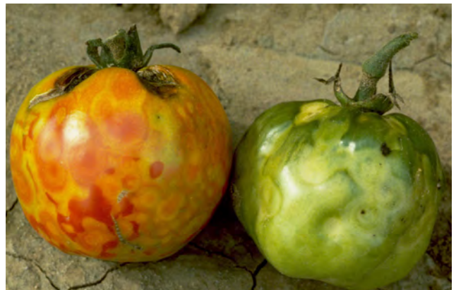
Tomato fruit showing severe symptoms of Tomato spotted wilt virus, which is transmitted by WFT