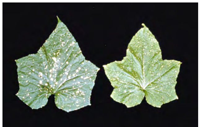
Spotted foliage caused by WFT has a coarser pattern (left) than damage caused by Thrips tabaci (right)

P.M.J. Ramakers, Applied Plant Research, Bugwood.org