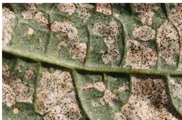
Feeding on leaves can lead to leaf discoloration