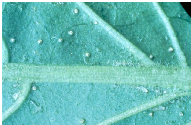
Eggs are laid in slits in the leaves

Monitor all crops routinely for the presence of pests and use yellow sticky traps where possible.