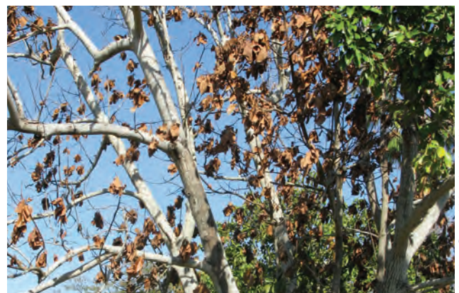
Development of laurel wilt on part of a tree