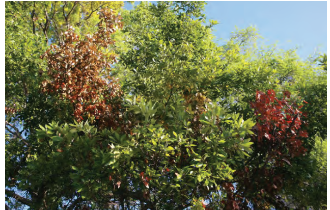
Defoliation of upper canopy and symptoms developing in lower portions of the tree