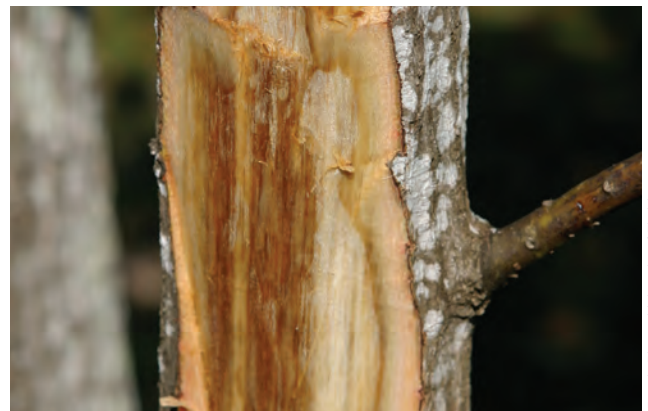
Internal vascular discolouration of an avocado stem