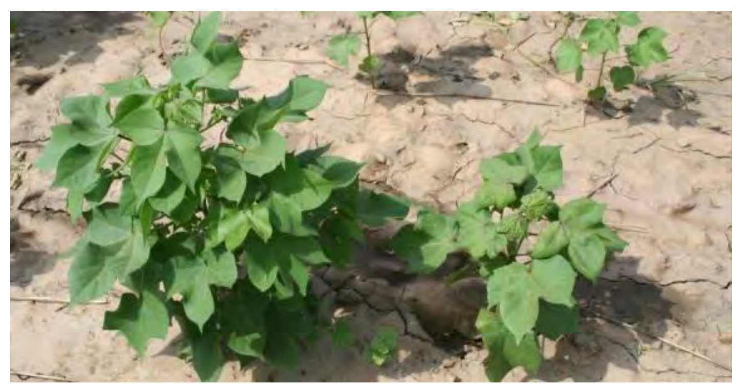
Figure 3. A CLCuD-affected plant on the right showing the typical stunting symptoms, growing next to a healthy plant