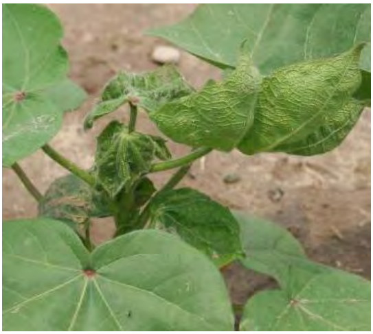
Figure 1. Upward cupping of leaf margins and thickening of leaf veins

Plants which are stunted and/or have deformed leaves, particularly with cupping, should be selected for closer evaluation. Holding suspect leaves up to the light can help in identifying disease symptoms of thickening and darkening of the leaf veins and the presence of abnormal growths emerging from leaf veins.