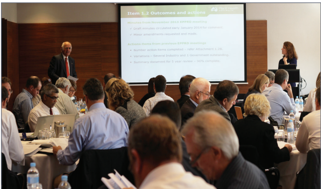
Member meetings – including EPPRD signatory meetings, industry forums and member forums – are an important way in which the company brings government and industry members together to discuss aspects of the biosecurity system. Meetings can also bring together the PHA and AHA Boards or industry members to discuss topics common to the stakeholders of each company