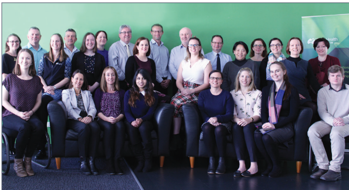
By June 2020, the company had grown to employ 35 staff, most of whom were located in the Canberra office, but others were in WA, SA and Queensland