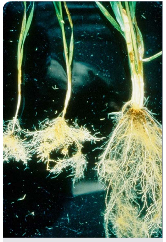
Stunted root growth on cereal plants

If you see anything unusual, call the Exotic Plant Pest Hotline on 1800 084 881 .