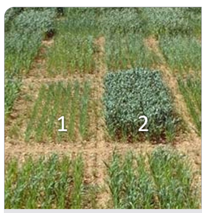
Yellowing and stunted crop growth on intolerant (1) and tolerant (2) oat varieties

As with all soil-borne diseases, this exotic nematode pest spreads in contaminated soil and plant material, as well as machinery, equipment and clothing. Brown cysts can also be windblown.