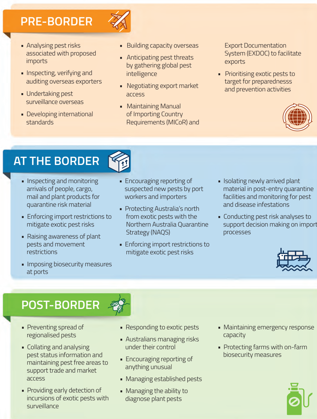
Figure 4. Biosecurity activities that reduce the risk of entry and establishment of exotic pests.