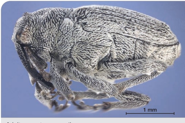
Adult rape stem weevil