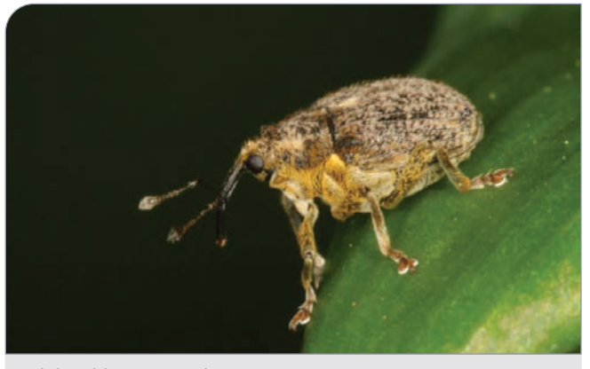
Adult cabbage weevil