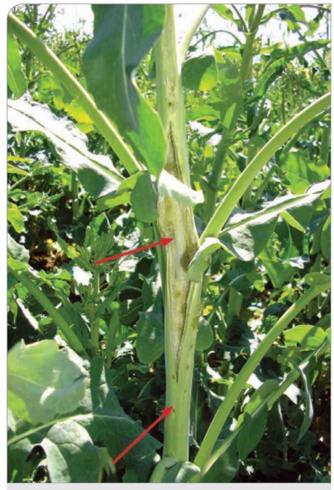
Damage caused by rape stem weevil. Note stem splitting and exit holes (arrows)

If you see anything unusual, call the Exotic Plant Pest Hotline on 1800 084 881 .