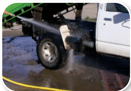
Ensure all vehicles are free of soil and plant material before entering and leaving the farm

To clean vehicles and equipment effectively, use a detergent and degreaser and pay particular attention to tyres, radiator grills, wheel arches, sump guards floor mats and under carriages where seeds and dirt can lodge. If you use high pressure air to clean vehicles and equipment, make sure soil and plant material isn't blown into crops or waterways.