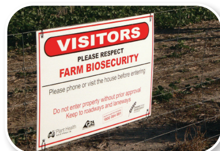
Biosecurity signs raise farm biosecurity awareness with visitors and contractors