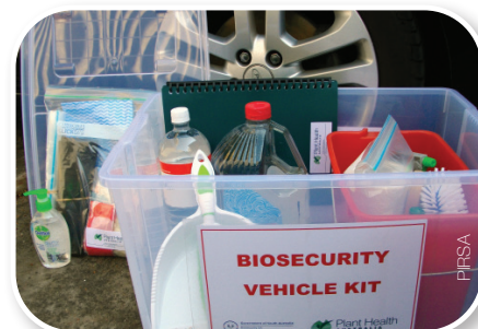
Apply a decontaminant solution to all surfaces that have come in contact with mud or dirt.