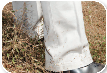
Seeds can be spread on clothing as well as machinery