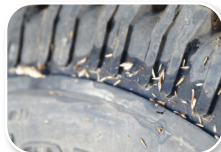
Check tyre tread for weed seeds, mud and plant debris