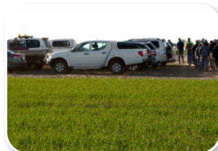
Providing parking areas for visitors and contractors reduces the area of the property put at risk