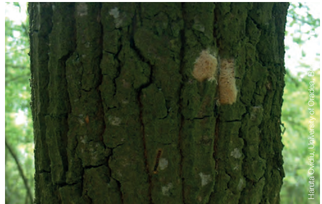
Gypsy moth egg masses on a tree trunk