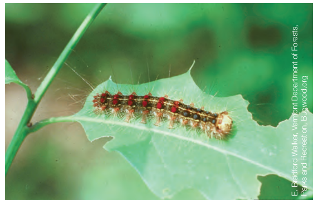
Larval stage of Gypsy moth