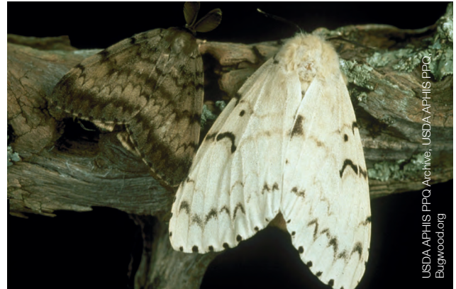
Male (L) and female (R) adult Gypsy moths

Damage from early instar larvae appears as small holes in the leaf. As the larvae grow, the holes become larger and feeding occurs along the leaf margin. In the final instar stage the larvae consume the entire leaf. Large, eruptive populations occur in cycles and appear to be more frequent in the Asian biotype. Generally, larvae feed by day in the early instars and at night from the fourth instar onwards. However, at high population densities, larvae feed continuously, day and night, until the host's foliage is completely removed. Repeated defoliations can cause tree death. Tree mortality also occurs if Gypsy moth defoliation coincides with another stress, like drought. The larval hairs cause allergies in some people.