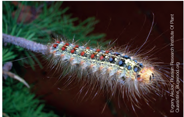
Larval stage. Note colouration

Disclaimer: The material in this publication is for general information only and no person should act, or fail to act on the basis of this material without first obtaining professional advice. Plant Health Australia and all persons acting for Plant Health Australia expressly disclaim liability with respect to anything done in reliance on this publication.