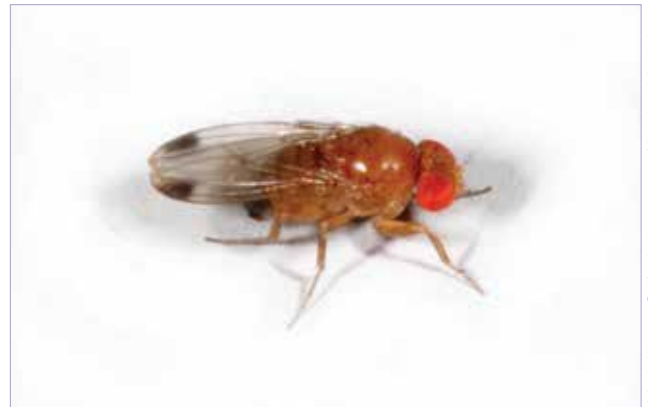
Martin Hauser, California Department of Food and Agriculture

Adult SWD are 2-3 mm long with a wing span of around 6-8 mm. They are yellow-brown with dark bands on the abdomen and prominent red eyes. Females have a distinct double serrated ovipositor that is used to puncture the intact skin of suitable fruit and lay eggs. Males are typically smaller than females, and can be distinguished from females by the small dark spots on the end of their wings.