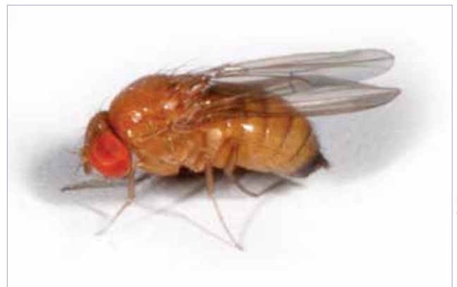
Martin Hauser, California Department of Food and Agriculture

Adult males are yellow-brown with dark abdominal bands, red eyes and distinct spots on the ends of their wings