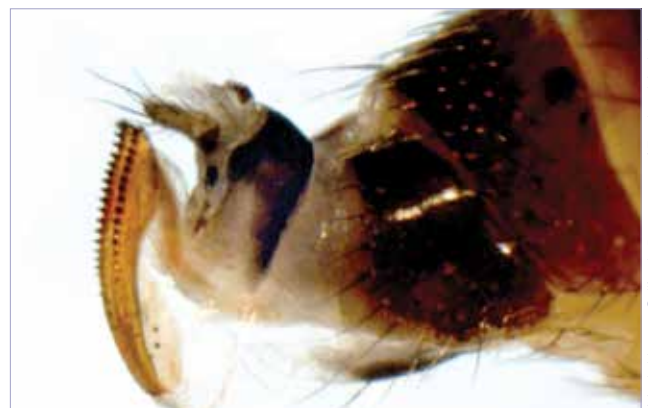
Martin Hauser, California Department of Food and Agriculture

Adult females are yellow-brown with dark abdominal bands, red eyes and no spots on their wings