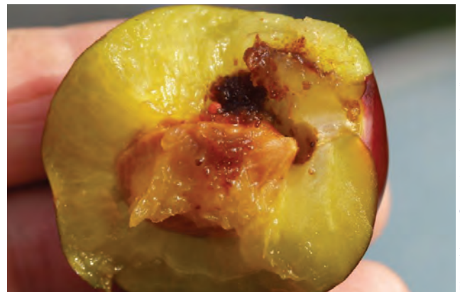
Internal damage is not seen unless the fruit is opened