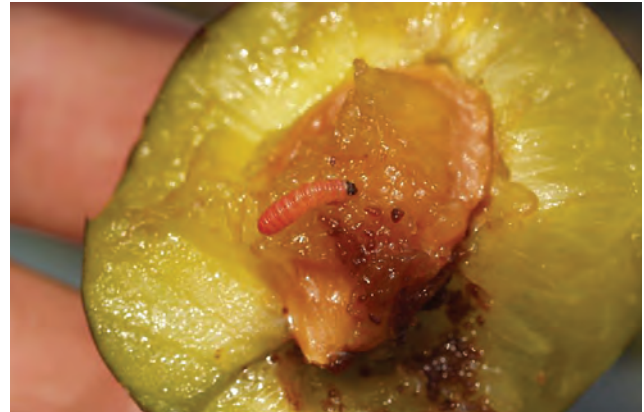
Internal damage caused by larval feeding