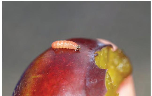
Fully-grown larvae are 10-12 mm long