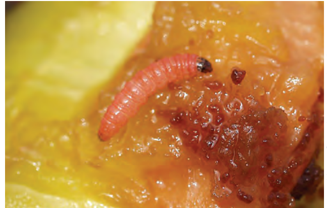
Larvae have red/pink backs and dark heads

The entrance holes from young larvae are not easily spotted on the fruit, but sticky gum exuding from the holes may be visible. The most noticeable symptom in young fruit is a change in colour from green to violet, which is typically followed by fruit drop. In more mature fruit, infestation with larvae leads to premature ripening.