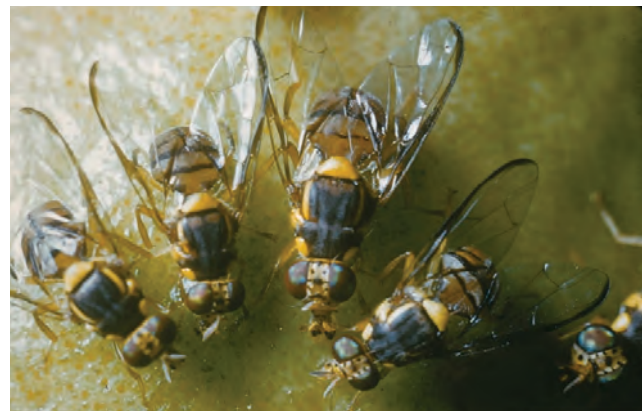
The thorax (chest) has yellow stripes on top and yellow marks on each side