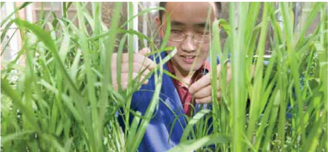
Sugarcane field research.

The NPBDS, together with the overarching NPBS, has been developed recognising the Intergovernmental Agreement on Biosecurity (IGAB). This agreement between the Australian, state and territory governments, aims to strengthen the working partnership between governments, broadly identifies their roles and responsibilities and outlines the priority areas for collaborative effort to improve the national biosecurity system. Implementation of the Recommendations contained within this NPBDS will complement and deliver on a number of priority reform areas of the IGAB (see Table 1).