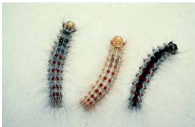
Examples of Asian gypsy moth larval forms