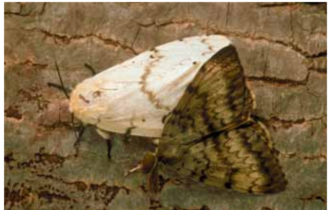
Male (bottom) and female (top) Gypsy moth adults