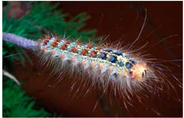
Hairy larvae showing distinctive blue and red spots

There are a number of endemic and exotic moth species within the same family as Asian gypsy moth, many of which are economically important pests of trees and shrubs. However, any moth or caterpillar that matches the Asian gypsy moth description should be referred to an expert for formal identification.