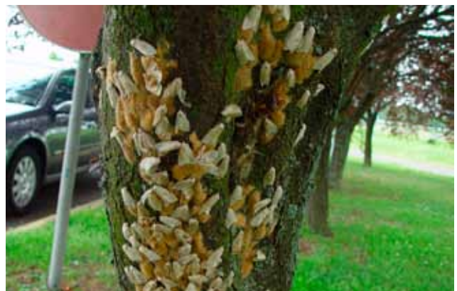
Large numbers of egg masses can be found on single trees or other solid objects