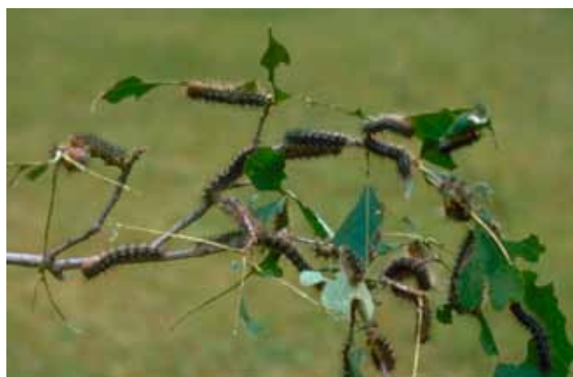
Caterpillars feeding on oak foliage