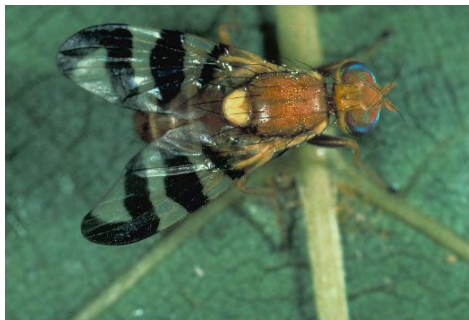
Adult walnut husk fly

This insect is found in the United States where it is present in the large Californian Walnut growing areas. It has also been reported in some European countries.